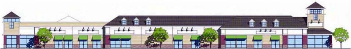
Main Street Elevation

100 Main Street (Route 28), Reading, MA 01867