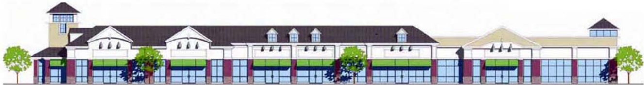
Parking Lot Elevation